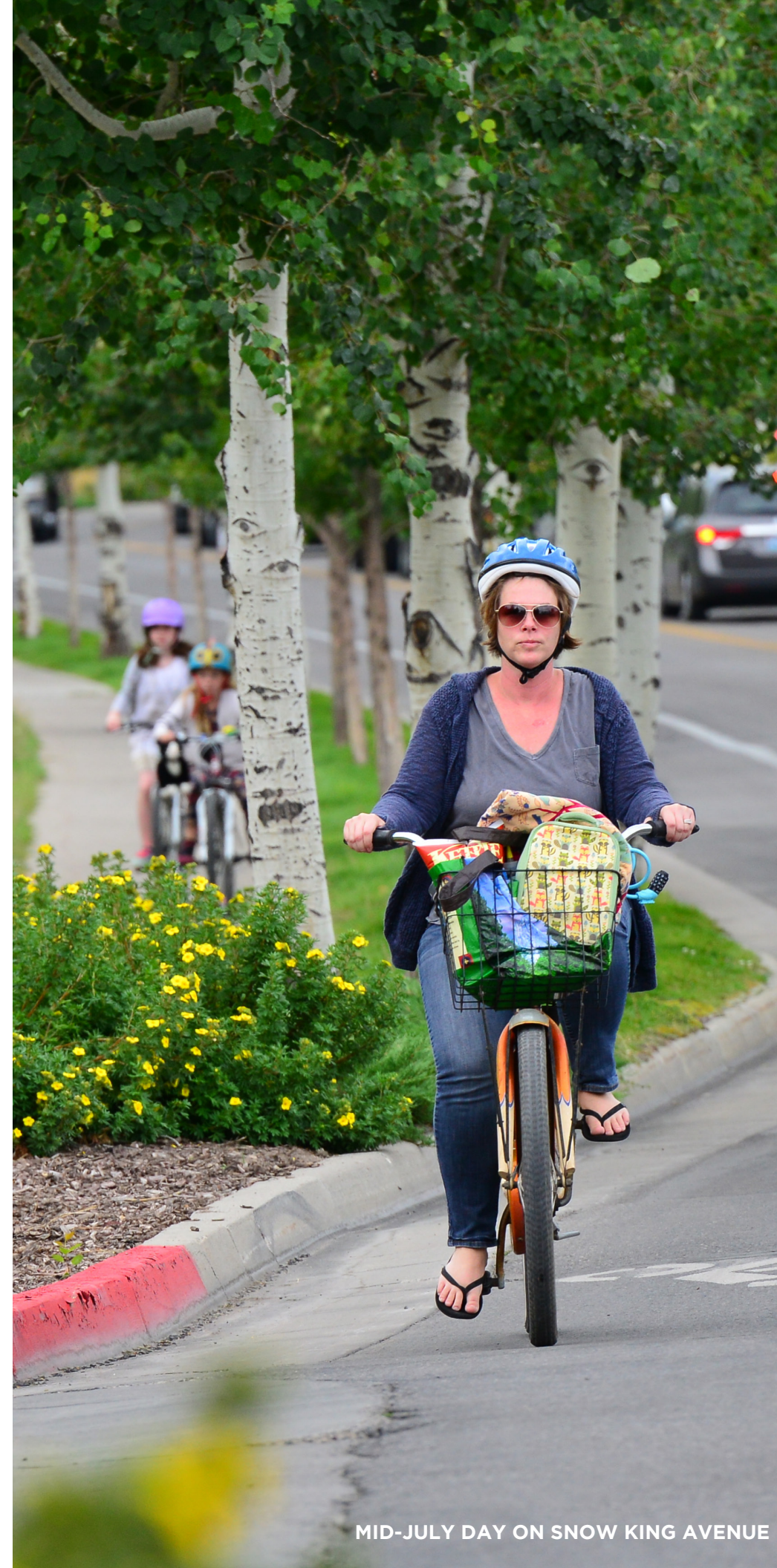
MID-JULY DAY ON SNOW KING AVENUE

A Dutch survey from 2012 demonstrated that e-Bikes have the potential to grow bike commuting trips by 4-9%.