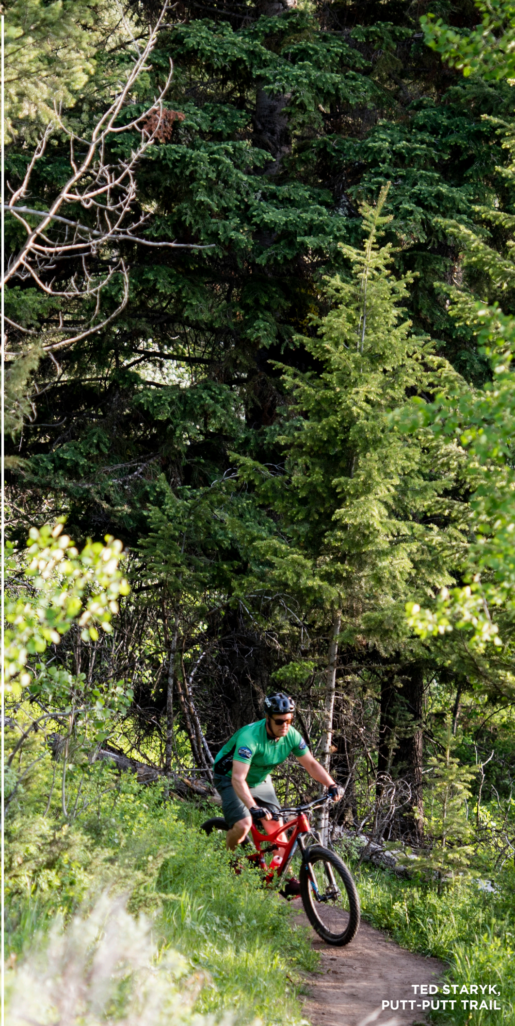
TED STARYK, PUTT-PUTT TRAIL

TREES REMOVED BY FRIENDS OF PATHWAYS TRAIL CREW